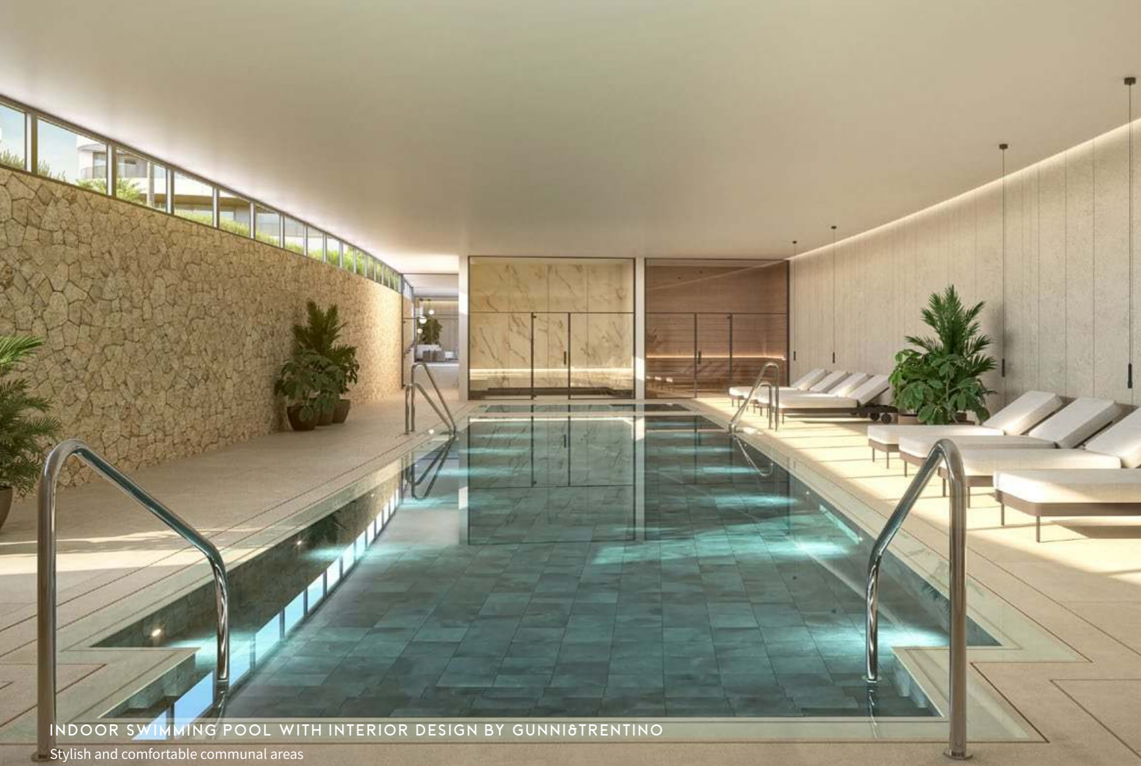
INDOOR SWIMMING POOL WITH INTERIOR DESIGN BY GUNNI&TRENTINO