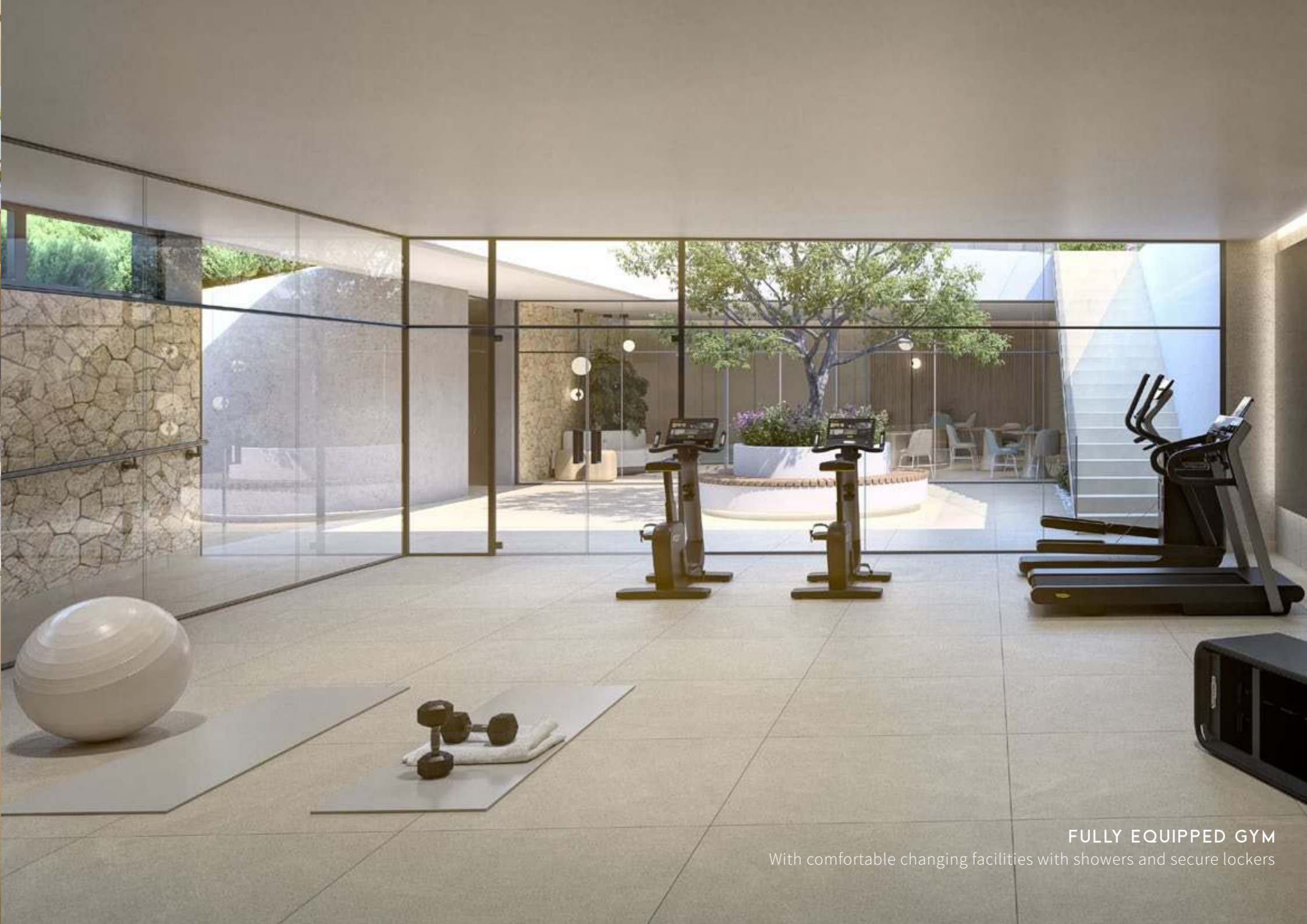
FULLY EQUIPPED GYM With comfortable changing facilities with showers and secure lockers